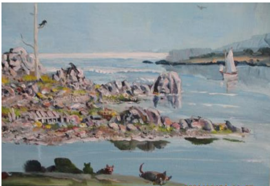
Jerome Andrews: Ancient Shores, Acrylic on panel

These observations of a lifetime's fascination may play a role as documentation of passing times. As we engage with these images, let us remember those who came before, and conserve for the following generations with respect and caring for the coast, seas, and all of its inhabitants—past and future.