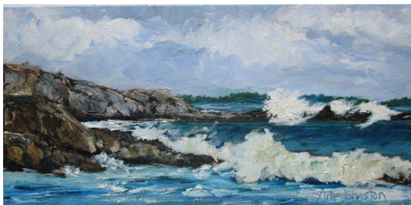
Storm at Sea: Oil on canvas

This show has allowed me to portray the wonderful qualities of this region. While I have explored and painted many places in the world. I am always drawn back to our own coastal area of Fundy and Passamaquoddy for inspiration.