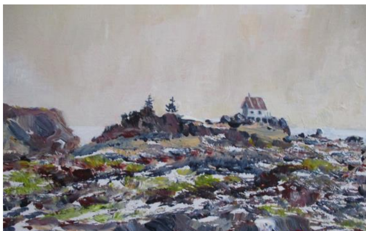
First Dusting: Watercolour