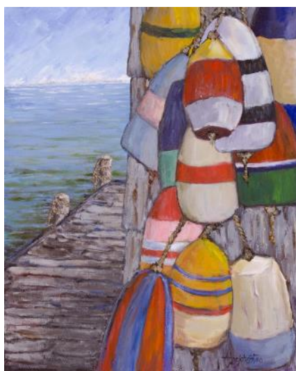
Buoys: Oil on canvas